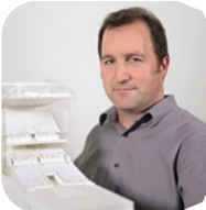
Tom Jones Building