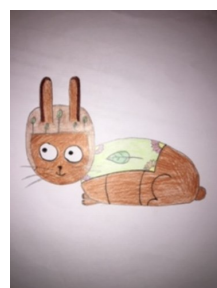
Liana C (6M)