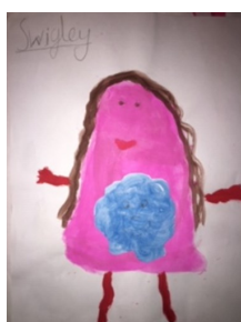
Leila W (3A)